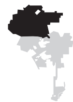
Figure 3-4 Long Range Land Use Diagram San Fernando Valley